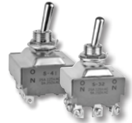
Changes for S30 & S40 Toggles

Contact No. 319 was originally released September 2017. Since that time, NKK Switches has decided that Change 2 (page 2) will not be implemented, effective May 2018 (Contact No. 319-A). There are no modifications to Changes 1 and 3, which will be administered as indicated.