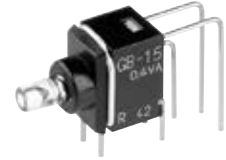
LED Changes for GB Illuminated Pushbuttons

The GB Illuminated Pushbuttons will have a change to the LED specifications for Red, Amber and Green. The change will effect all illuminated models, both standard and custom. The specification changes are outlined below, followed by effected standard part numbers.