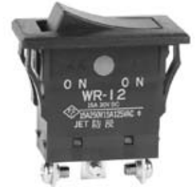
WR Rocker Before Label Change

WT, WR and WB Series with the PSE marking will have changes to the identification labels on the switch bodies, and the old logo will be replaced with the new one. The change will effect both standard and custom models, and includes all WT and WB models, and WR rockers with screw lug and wire lead terminals. The following table shows examples of the differences before and after the modification. The part number tables show standard models of each series effected by the change.