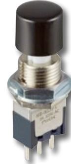
Changes for MB Series Pushbuttons

I. There will be a revision to the material of the plunger for MBN models of the MB Series Pushbuttons with large 12mm bushings (codes B1 and B3). The plunger material, formerly polyacetal, will change to polybutylene terephthalate (PBT). This revision will apply to both standard and custom switches. Effected standard part numbers are listed on the table below.