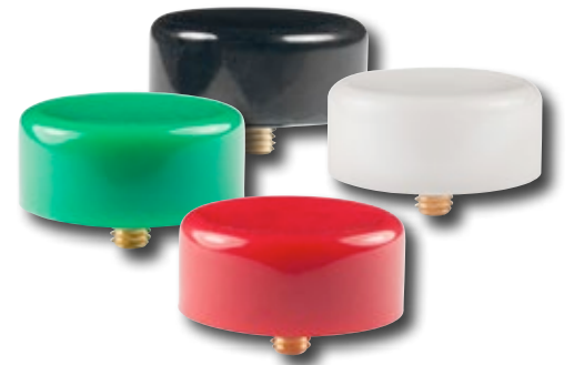
Changes to AT412 Caps in Underside Structure and Material

Effected standard part numbers are on the table below.