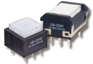
UB Series with Super Bright White LED

The Super Bright White LEDs for UB Series pushbutton switches and indicators will be changing. Both standard and custom pushbuttons and indicators are included in the revision. The change will effect electrical specifications, which are compared below with the new specifications. Part numbers for effected standard switches and indicators are shown on the following page.